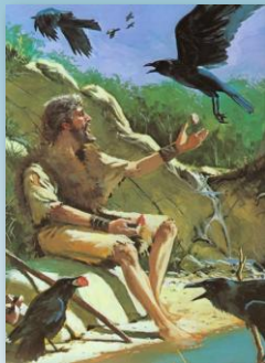
Elijah, The Believer